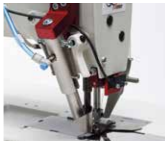
Auto Tape Cutter