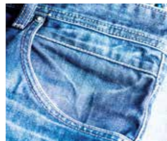
Front pocket sample